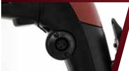
Charger port located conveniently in tiller.