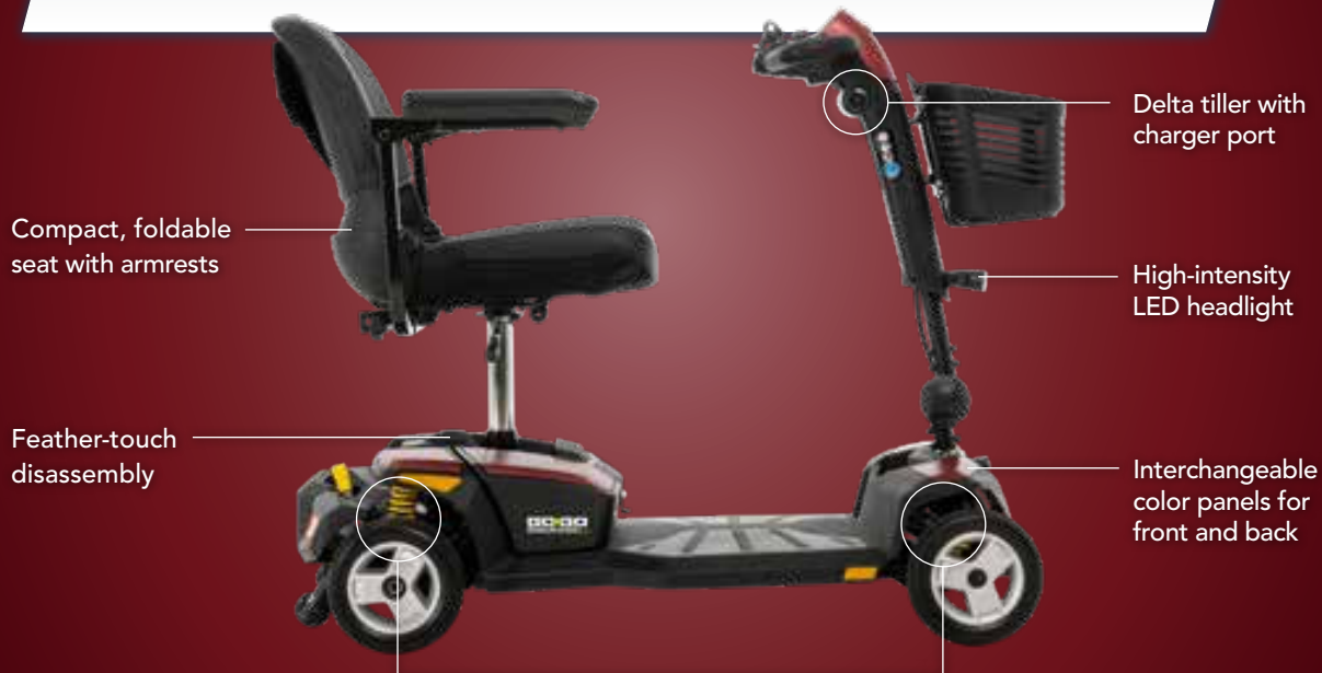
CTS Suspension for greater comfort