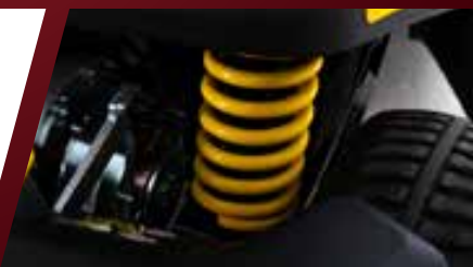
Comfort-Trac front and rear suspension for added comfort.

With the Go Go® Endurance Li , traveling has never been easier! This 4-wheel scooter has everything you need for a safe and convenient trip. With the standard 8AH airline-compliant lithium-ion battery pack**, the Go Go Endurance is perfect for air travel. Feather-touch disassembly provides the portability you need. When you arrive at your destination, enjoy a smooth, comfortable ride with Comfort-Trac Suspension.