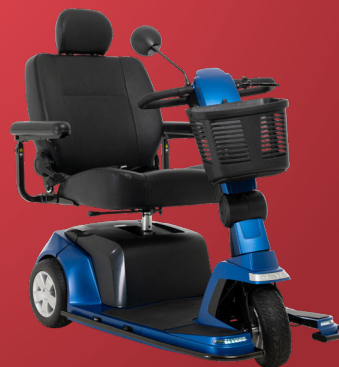
3W — FDA Class II Medical Device 1