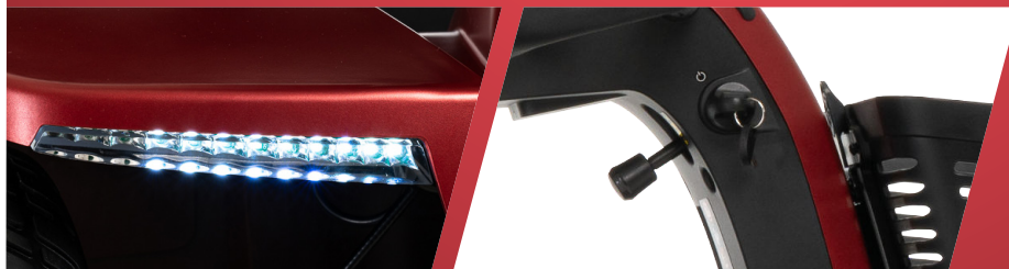
Full LED light package