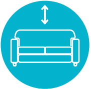
PROVIDES ASSISTANCE IN AND OUT OF COUCH OR CHAIR