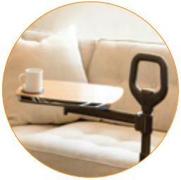
INCLUDES CUP HOLDER AND UTENSIL COMPARTMENT