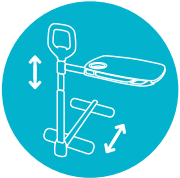
ADJUSTABLE IN HEIGHT AND DEPTH