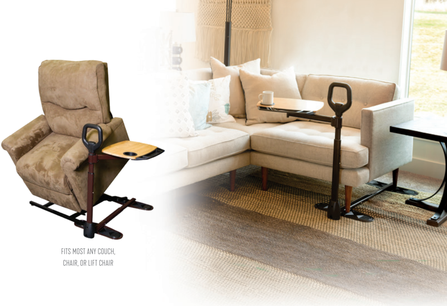
FITS MOST ANY COUCH, CHAIR, OR LIFT CHAIR