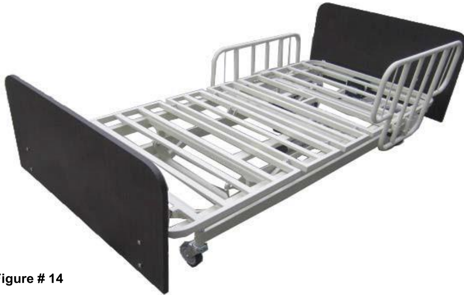
Figure # 14

Raise the side rail until it clicks into place. Pull the spring release locking knob button to lower or raise the side rail. Release to lock rail in place - see figure # 3.