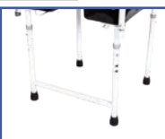
P13642 Legs w/Crutch Tips (height seat range from floor to bottom frame-16"-19")