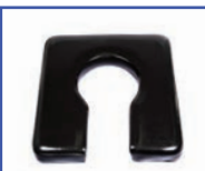
P60913* 18"Wx18"D Ensolite® 2" waterfall foam Front/Rear Open Seat A-5.25"xB-8" opening