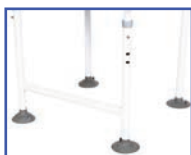
P13643 Legs w/Suction Tips (height seat range from floor to bottom frame-16"-19")