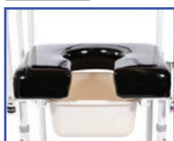
P13876 18"Wx18"D Pan/Hanger