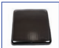
P61086* 18"Wx18"D Ensolite® 2" foam Solid Seat