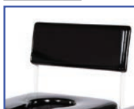
P13295 Back Tubes w/Solid Back Pad (13.5"H)