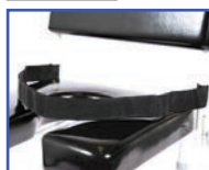
PW60884 Waist Belt (64" circumference with 12" overlap)