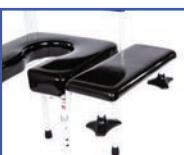
P13352 Short Transfer Bench