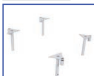
P13641 18"Wx18"D White Stainless Steel Frame