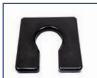
P60993* 18"Wx18"D Comfortuff 1.5" waterfall foam Front/Rear Open Seat A-5"xB-8" opening