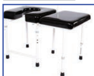
P13294 B-O Transfer Bench