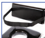
PT60909 Trunk Belt (54" circumference with 12" overlap)