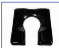
P61058 18"Wx18"D Ensolite® 2" waterfall foam Front Open Contoured Seat A-5.5"xB-8.25" opening