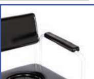
PL13291 Left Hand Armrest with Pad