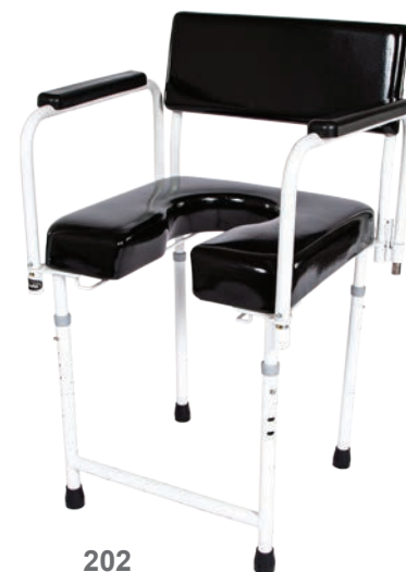
202 with Support Options