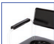
PR13291 Right Hand Armrest with Pad