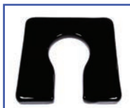
P60850* 18"Wx18"D Ensolite® 1" waterfall foam Front/Rear Open Seat A-5"xB-8" opening