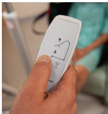
Ergonomic and easy-to-use hand control with 4 buttons.

Eva floor lifts have an emergency stop button easily accessible on the control box. The lift also has both electrical and manual emergency lowering. The battery has high capacity, performing many lifts per charge, which means less frequent charging. An indicator on the control box shows when charging is in progress and when the battery is fully charged. Built-in charging is standard.