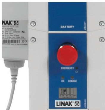
New control box with diagnostics, e.g. lift counter and overload indicator.